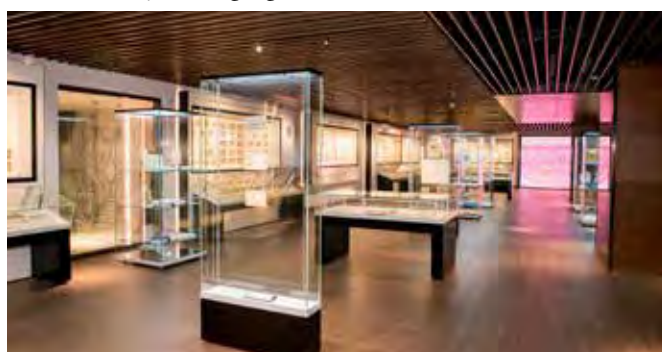
Wide-angle View of the Museum Interior

The museum is beyond any expectations of accuracy, perfection and is overwhelming. Being a professional architect, I realized the volume of effort, timing and expenses needed to establish a state-of-the-art museum enriched by the material, ambiance and method of display. Locating the museum within the premises of Prestige Group's Corporate Headquarters ensured that it will be always under the umbrella of Rezwan Razack for daily follow-up, upgrading and smoothly managing.