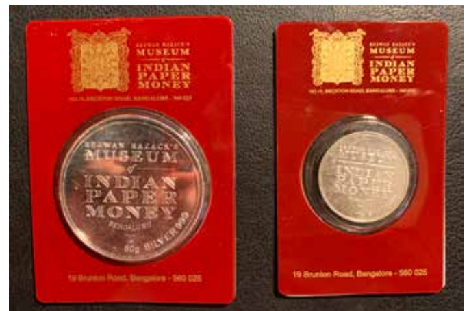
Commemorative Silver Coins Minted for the Museum