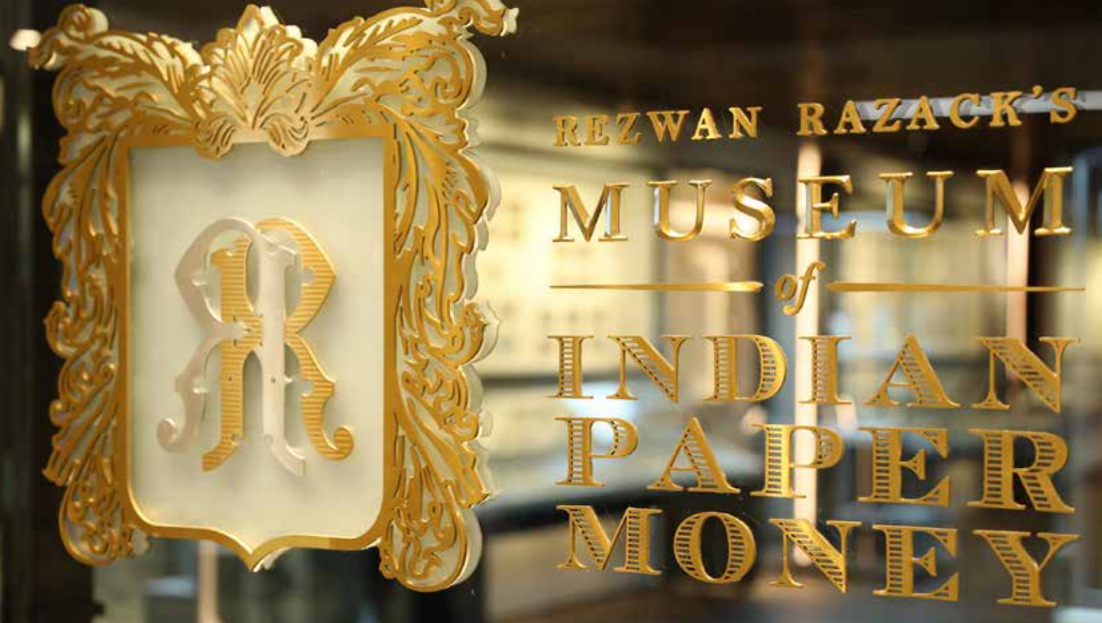
Museum Emblem Engraved on the Glass Entrance