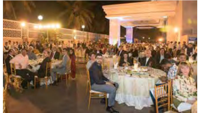
Dinner at Backyard of Prestige Headquarters Building

invited to the inaugural event afterward which took place at the garden of Prestige Group’s Corporate Headquarters building. A film on the history of building up Rezwan’s collection and establishing the museum was shown. Later the honorable guests gave their speeches followed by greeting and thanking the museum team, and capped off by an authentic Indian cuisine dinner.