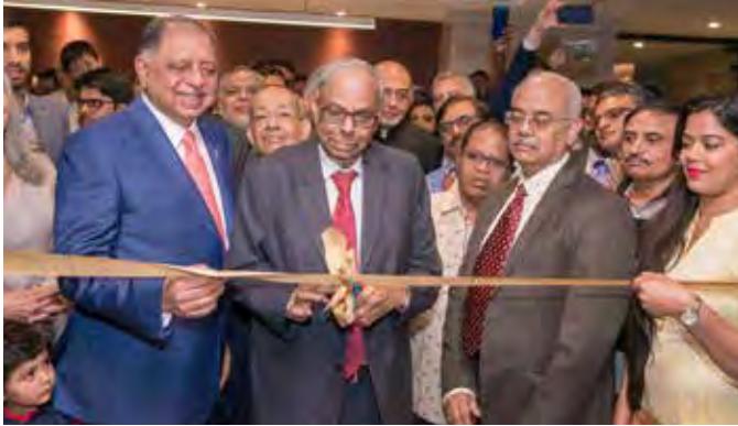
Inauguration Ribbon Cutting by the Former Governor of RBI