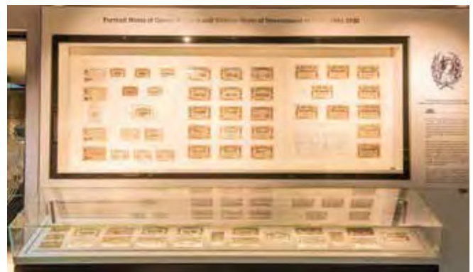
Portrait Notes of Queen Victoria and Uniface Notes of Government of India, 1861 - 1930

A visitor to the museum will enjoy a fairy tale history of Indian Paper Money going back to the days of the French and Portuguese influence as well as the British colonial period from the eighteenth to the twentieth century. The displays reflect the story of money woven into the very being, uniting, dividing, giving a sense of identity and indeed mapping people and nations’ powers, progress, crises and triumphs.