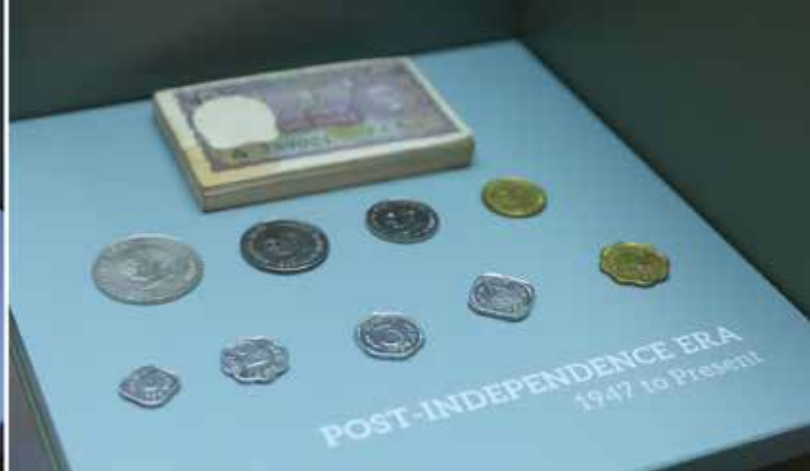
Currency in Circulation during the British Era and the Post-Independence Era to Present