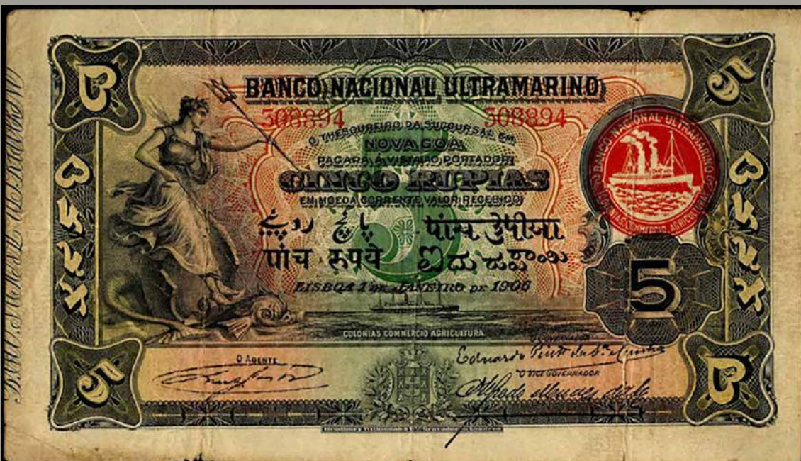
5 Rupias – Cinco Rupias with Seal 2 - Obverse