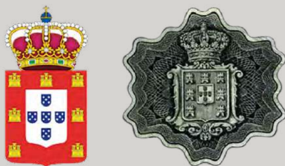
Royal Coat of Arms in Banco Nacional Ultramarino notes of 1906

From the second half of the 19th century, the Royal Coat of Arms became commonly represented with the shield covered by a mantle purple lined ermine issuing from the Royal crown.