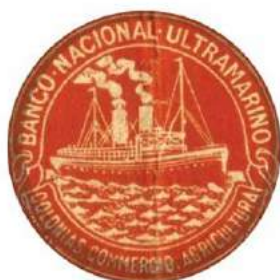
Seal 2 1918-1921