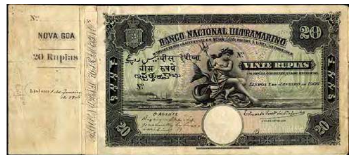
Hand painted Colour Essay with counterfoil - 20 Rupias – Vinte Rupias