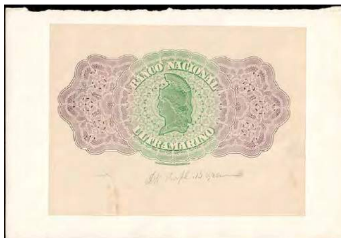
5 Rupias – Cinco Rupias - Reverse – Colour Trial

BANCO NACIONAL ULTRAMARINO NO _____ O THESOUREIRO DA SUCCURSAL EM NOVA GOA PAGARA A VISTA AO PORTADOR ..... RUPIAS EM MOEDA CORRENTE VALOR RECEBIDO NO _____ SEAL LISBOA EM ____ DE ____ DE 19 ____ O AGENTE _____ O GOVERNADOR _____ _____ O VICE GOVERNADOR _____