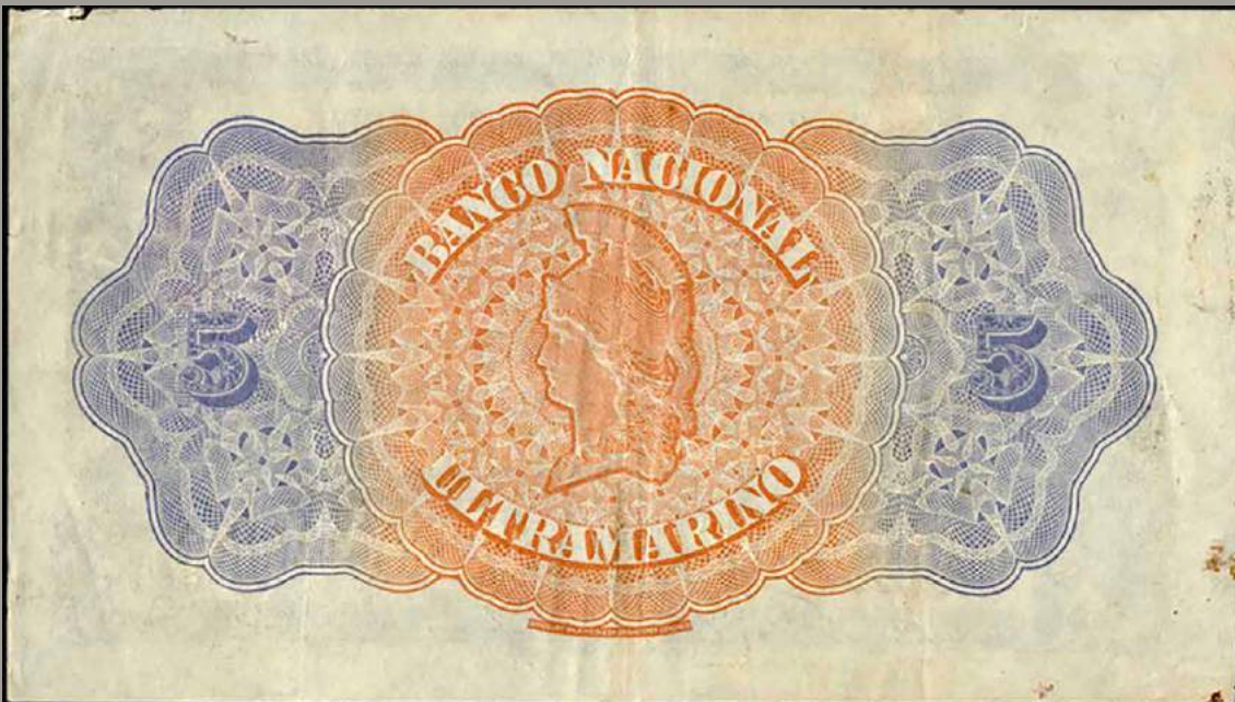
5 Rupias – Cinco Rupias with Seal 1 - Reverse