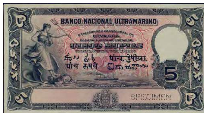
5 Rupias – Cinco Rupias - Specimen – Colour Trial