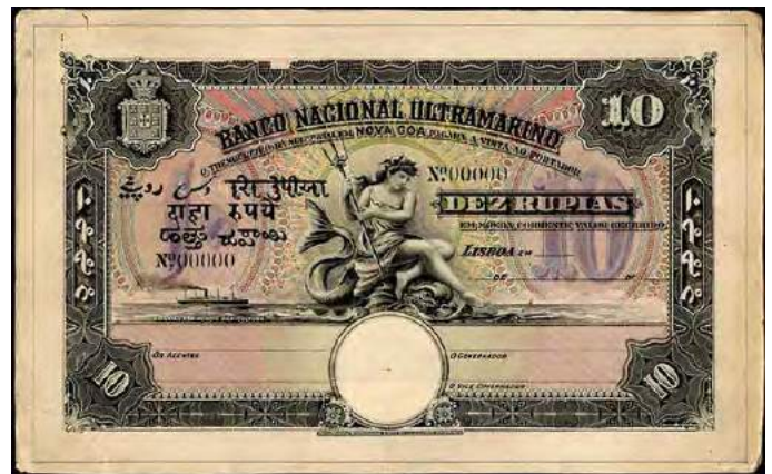
Hand painted Colour Essay - 10 Rupias – Dez Rupias Purple crayon colouring in denomination numerals