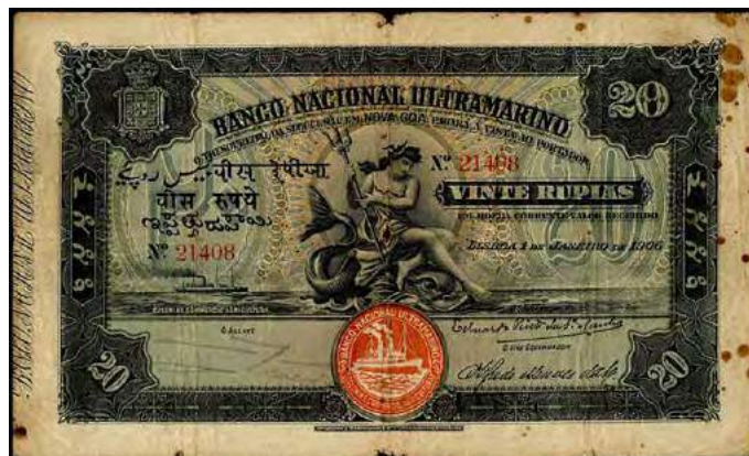
20 Rupias – Vinte Rupias with Seal 2 – Obverse

Watermark: The watermark reads 'INDIA / PORTUGUEZA' in two lines on the right