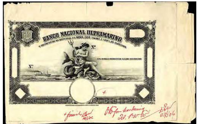
Black and white template pattern of note Manuscript notes in red 'x finish' and 'OK for hardening' Signatures dated 27/3/1906 and 28/3/1906