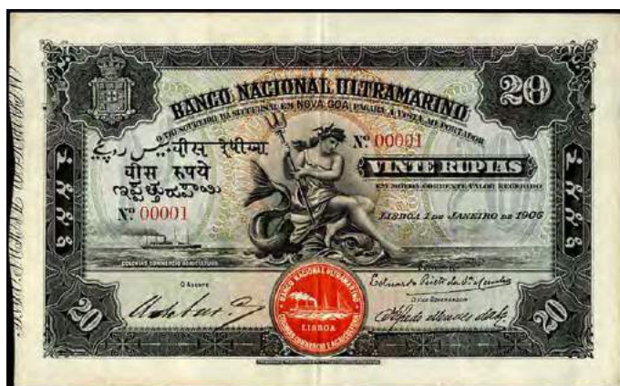
20 Rupias – Vinte Rupias with Seal 1 – Obverse