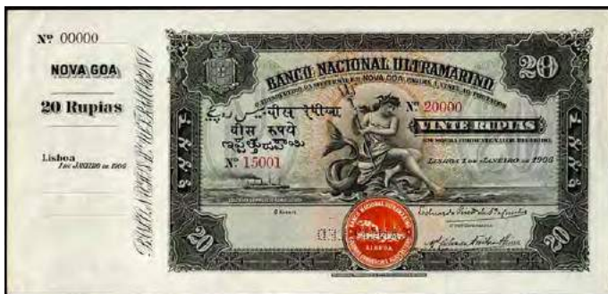
20 Rupias – Vinte Rupias – Specimen - obverse Perforated 'CANCELLED' in centre