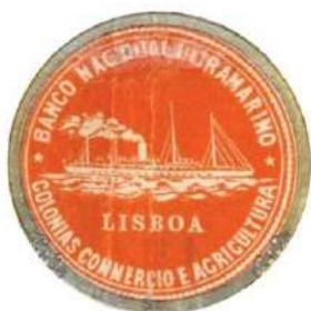
Seal 1 1906-1917

Round seal in red colour with a steam ship at the center with 'BANCO NACIONAL ULTRAMARINO' above and the bank motto 'COLONIA COMMERCIO AGRICULTURA' below.