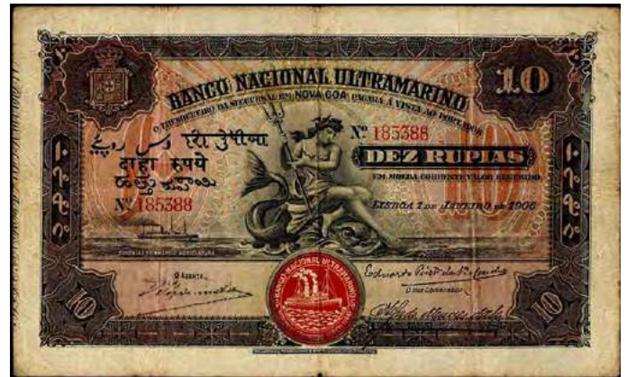
10 Rupias – Dez Rupias with Seal 2 – Obverse

Watermark: The watermark reads 'INDIA / PORTUGUEZA' in two lines on the right side of the note and 'BANCO NAC. ULTRAMARINO' centered towards the lower margin.