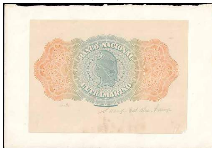
5 Rupias – Cinco Rupias - Reverse – Colour Trial