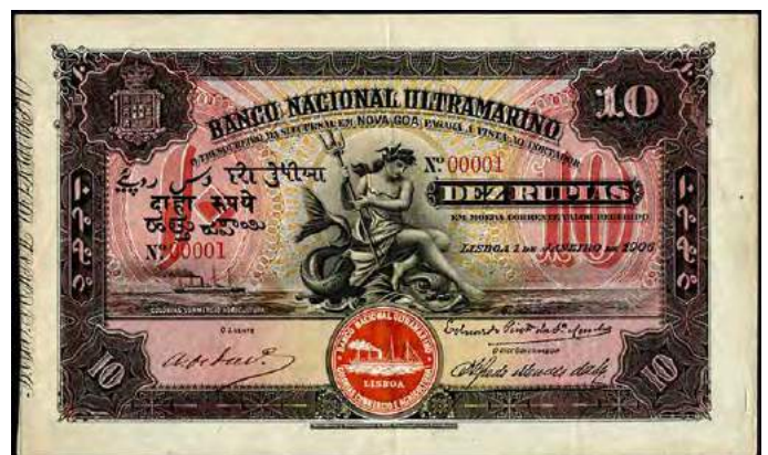
10 Rupias – Dez Rupias with Seal I – Obverse