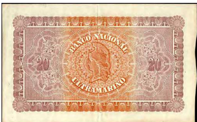
20 Rupias – Vinte Rupias – Reverse

Obverse: The notes are predominantly in pale blue, orange and black colour on the obverse. The guilloche in pale blue and orange colours forms a part of the central panel as an underprint with the border in black pattern. The title reads 'BANCO NACIONAL ULTRAMARINO' centered above in an arch, with the promise text below it in Portuguese, 'O THESOUREIRO DA SUCCURSSAL EM / NOVA GOA / PAGARA A VISTA AO PORTADOR / VINTE RUIPIAS / EM MOEDA CORRENTE VALOR REGEBIDO' which means 'The Treasurer of the New Goa pay on demand to the bearer 20 Rupias in cash for value received'. Motif in the centre is a maiden with a trident on a mythical sea chariot and a steam ship on the left below the serial number. The denomination in four languages Urdu, Gujarati, Marathi and Kannada is on the left. The promise text with denomination in words is on the right. The denomination in Urdu numeral is on the left and '20' on the right as an underprint. '20' in a rosette panel at the top right corner and at the lower corners of the note. The numerals are printed vertically in the four languages along the margins on either side. 'LISBOA 1 DE