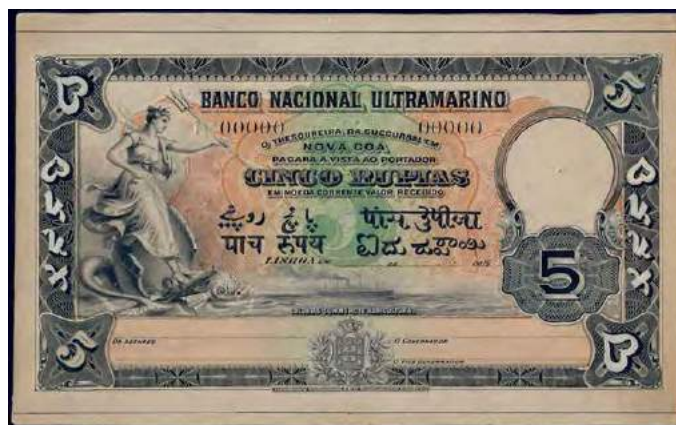
Hand painted Colour Essay - 5 Rupias – Cinco Rupias