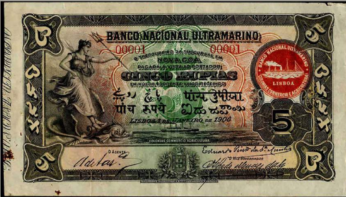
5 Rupias – Cinco Rupias with Seal 1 - Obverse