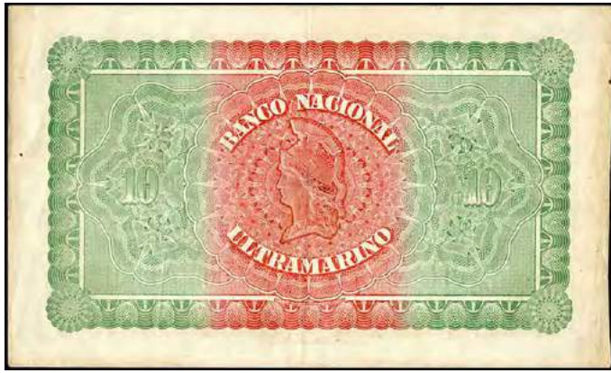
10 Rupias – Dez Rupias - Reverse