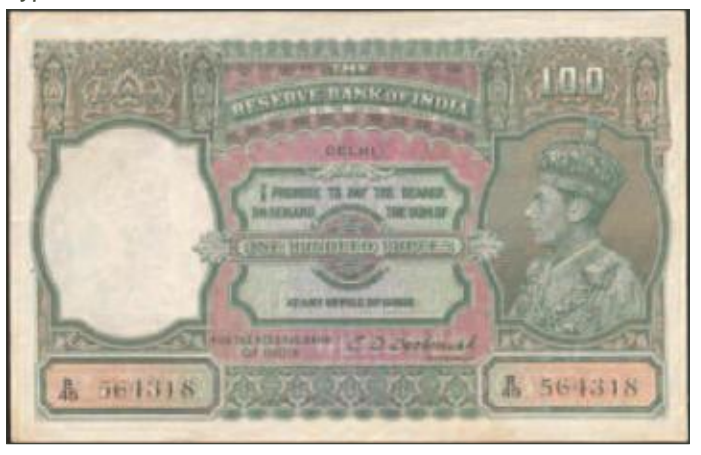
Reserve Bank of India one hundred rupees with profile of King George VI in the watermark; Delhi circle, C. D. Deshmukh signature.