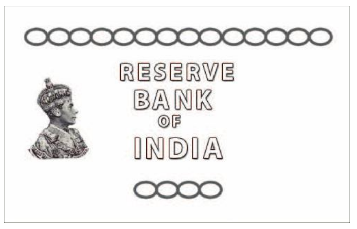
Watermark Type 1.

The watermark of the Type 1 and Type 2 notes showed a profile of King George VI facing right, with the text RESERVE / BANK / OF / INDIA in four lines. There are 14 links above and 4 links below. The image is imprinted on white machine-made paper.