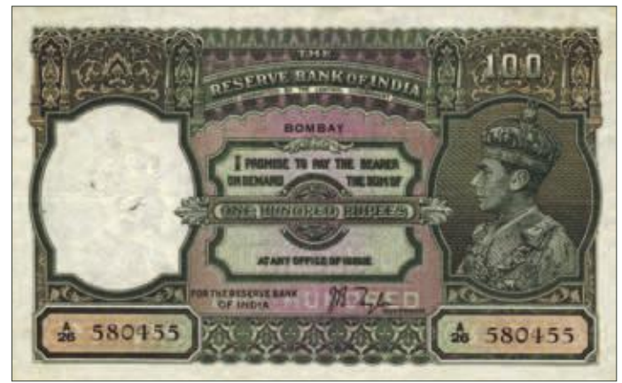
Reserve Bank of India one hundred rupees with profile of King George VI in the watermark; Bombay circle, J. B. Taylor signature.