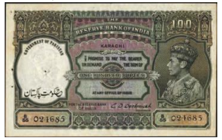
One hundred rupees, Karachi circle signed C. D. Deshmukh. Overprinted GOVERNMENT OF PAKISTAN / HUKUMAT-E-PAKISTAN.

In 1947 India was partitioned and during the interim period, Pakistan used Indian notes overprinted GOVERNMENT OF PAKISTAN in English and HUKUMAT-E-PAKISTAN in Urdu. These were not legal tender in India. They were discontinued in 1950 and remained in circulation in Pakistan until they were finally withdrawn in January 1952. It is interesting to note that notes with prefix B/54 to B/60 with Karachi Circle were printed in April 1948, the date on which the Pakistan overprinted notes printed at the Nasik Press were issued for use in Pakistan.