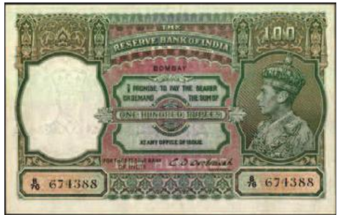
Reserve Bank of India one hundred rupees with a front-facing image of King George VI in the watermark; Bombay circle, C. D. Deshmukh signature; serial number in black.