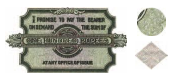
Microlettering found on front (left and top right) and back of 100 rupee notes.

100 in centre ONE HUNDRED RUPEES, 100 in centre RESERVE BANK OF INDIA in a diamond panel in the watermark window.