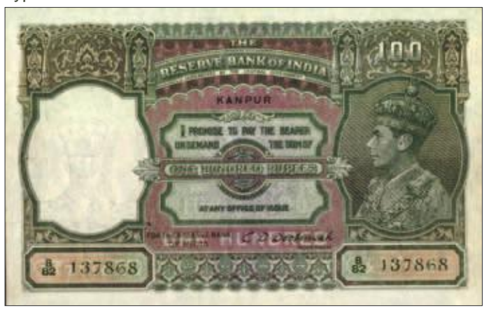
Reserve Bank of India one hundred rupees with a front-facing image of King George VI in the watermark; Kanpur circle, C. D. Deshmukh signature; serial number in green.