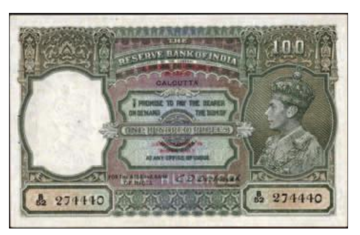
One hundred rupees, Calcutta circle, signed C. D. Deshmukh. Overprinted BURMA CURRENCY / BOARD / LEGAL TENDER IN BURMA ONLY.

BURMA CURRENCY / BOARD / LEGAL TENDER IN / BURMA ONLY in four lines in red. Issued from July 1, 1947. Demonetized on December 28, 1952. Overprinted on Type 1. Calcutta Circle of Issue.