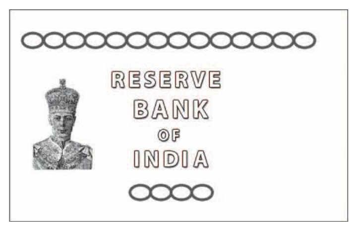
Watermark Type 2.

The watermark of the Type 3 and Type 4 notes shows a front facing portrait of King George VI, RESERVE / BANK / OF / INDIA in four lines, 14 links above and 4 links below. It was issued on notes in 1948. These were withdrawn from circulation on October 27, 1957.